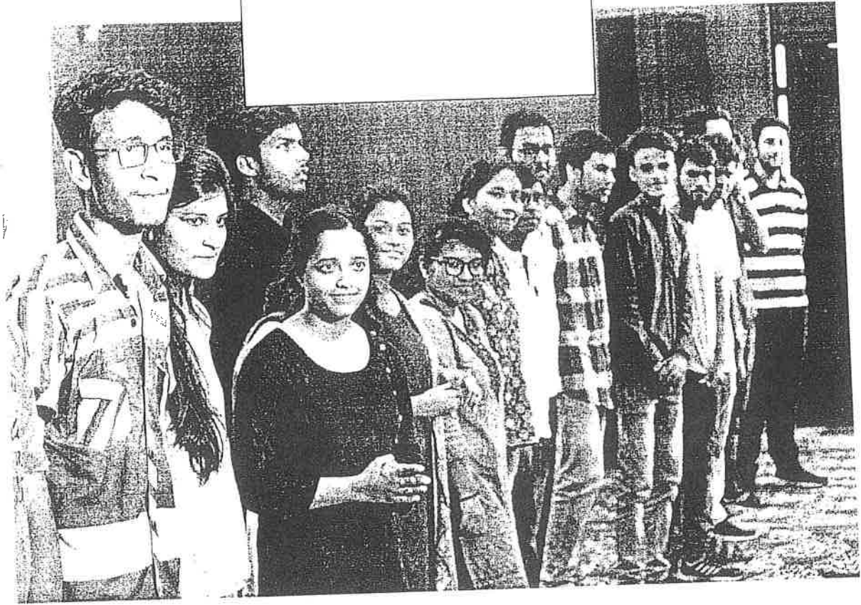
Glimpses of the Training Event Held on 05-09-2018