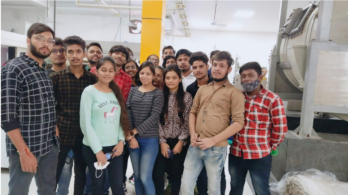
Group photo inside Industry