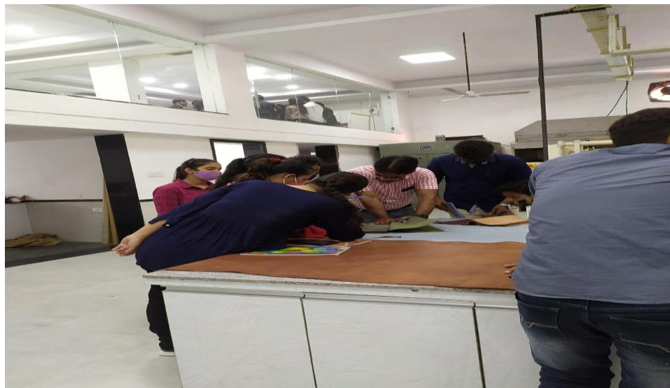
Students learning about the different type of processed leather