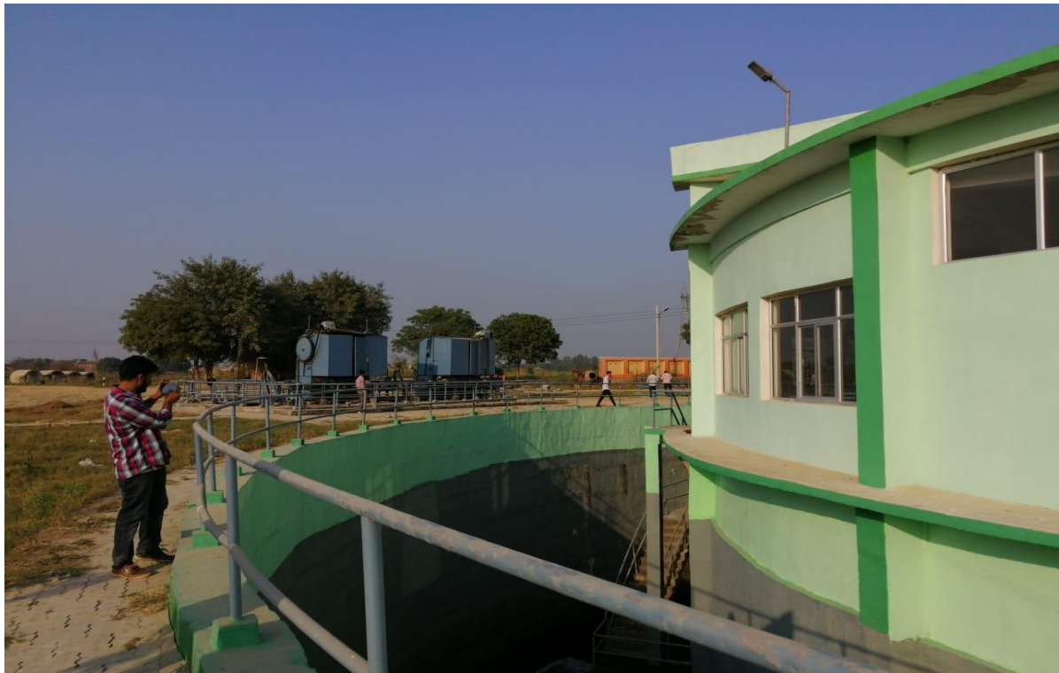
Field visit to UASB Based Wastewater Treatment plant- Sump cum collection well / SPS at Bingawan, Kanpur