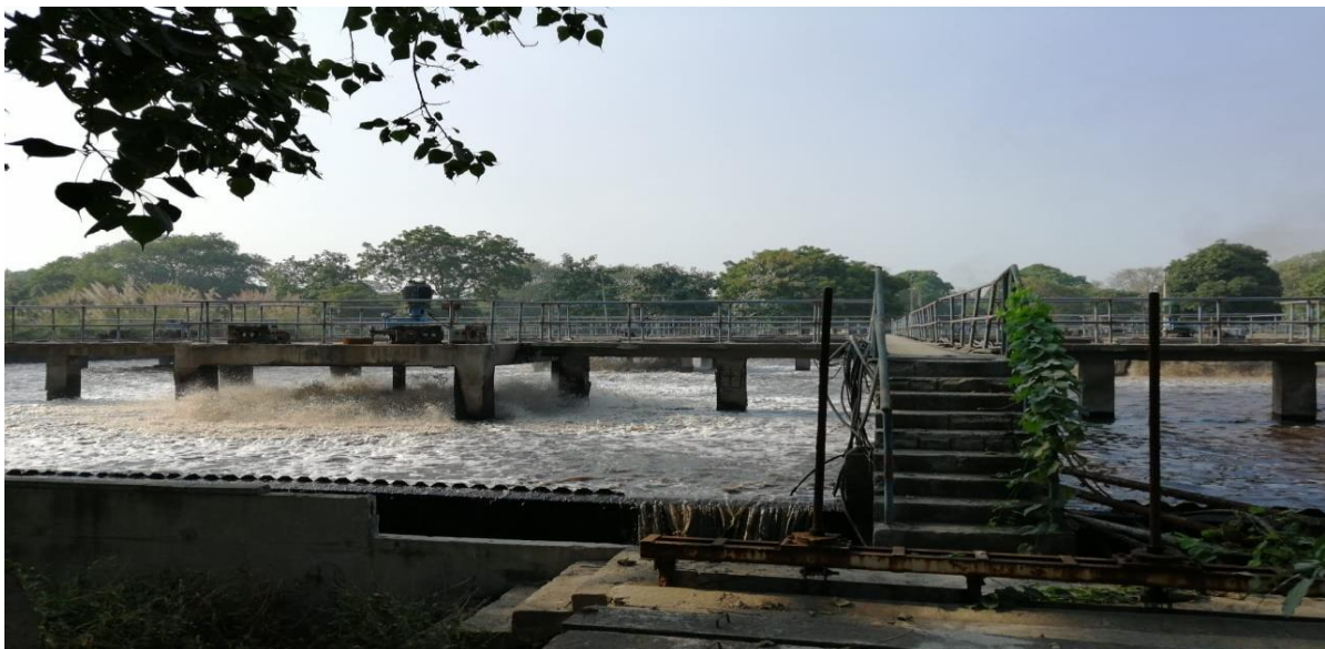
Field visit to Wastewater Treatment plant- Aeration Tank of ASP at Jajmau, Kanpur