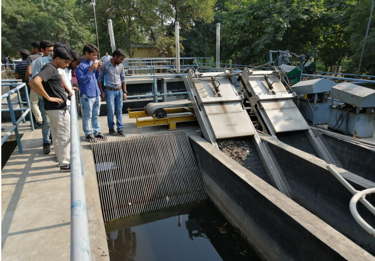
Field visit to Wastewater Treatment plant- Screen Chamber at Jajmau, Kanpur