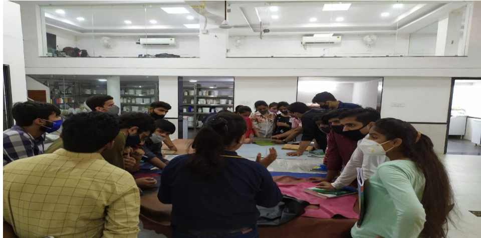
Students interacting with Industrial Officials