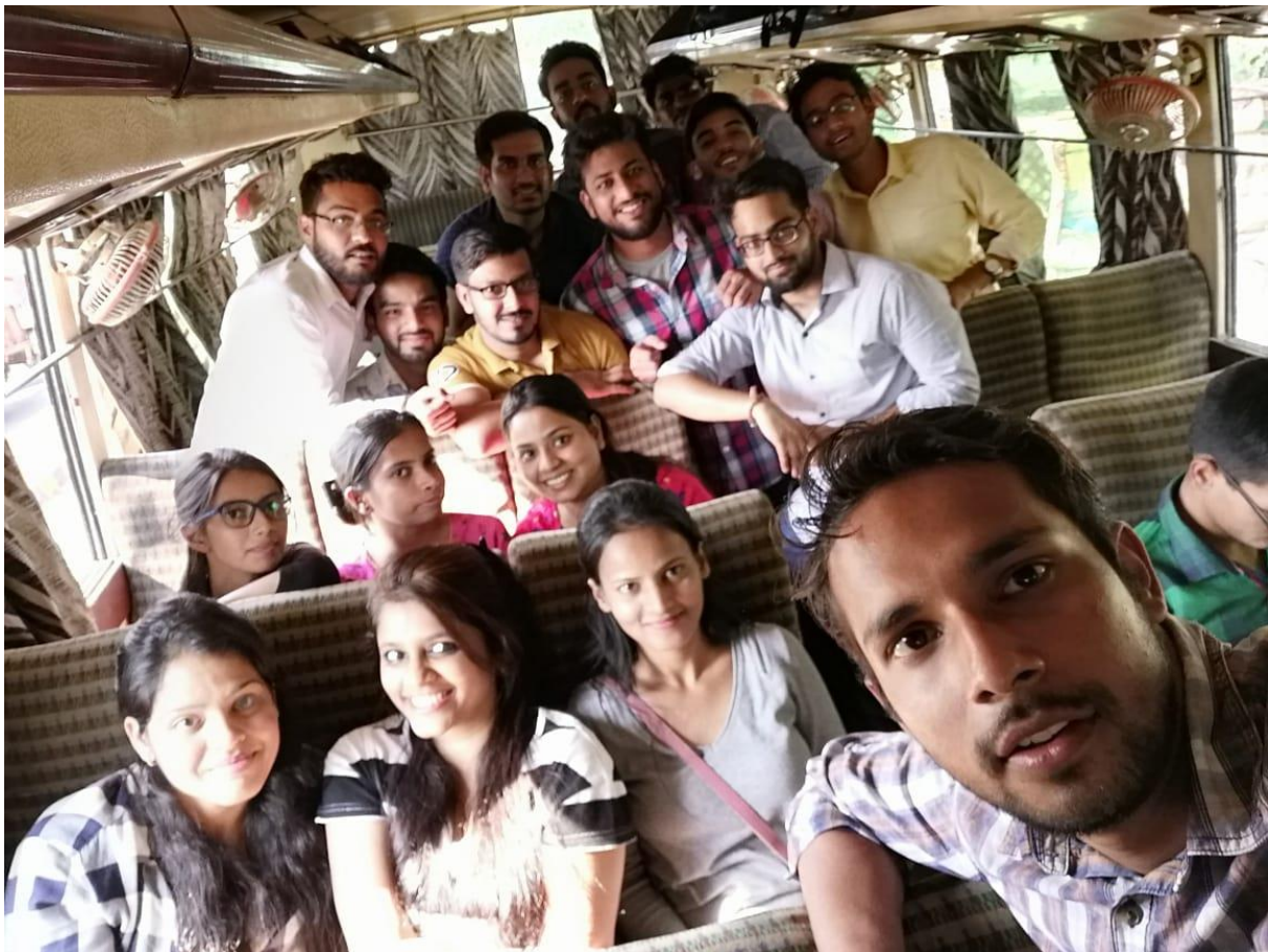
Students traveling for Field Visit to the Sewage treatment plant at Jajmau/Bingawan on