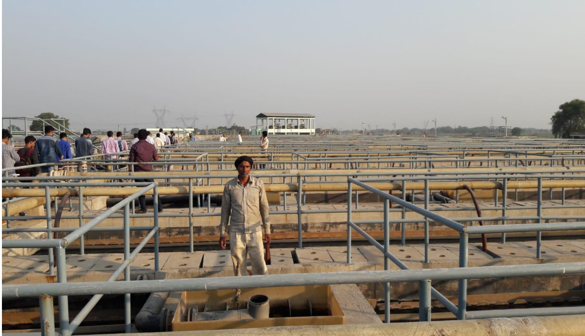
Field visit to UASB Based Wastewater Treatment plant at Bingawan, Kanpur