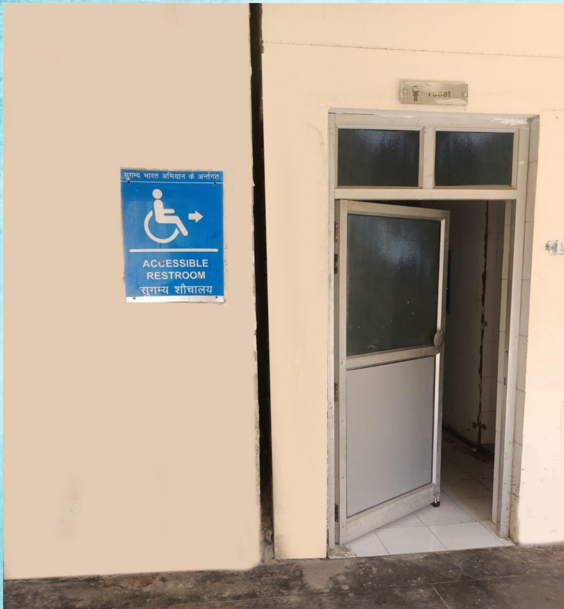
Washroom for Disabled Persons

Separate divyangjan friendly washrooms are available in the campus with scheduled maintenance, cleanliness and hygiene. The washroom are made in such a way that the divyangjan can sit with his/her wheelchair.