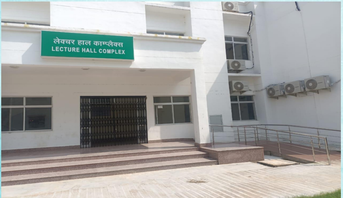
Ramp Tactile path for Disabled Persons