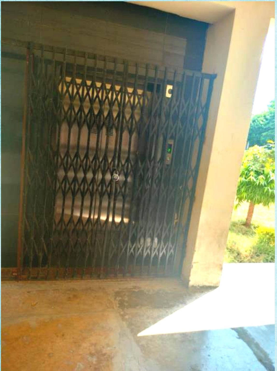
Lift for Disabled Persons