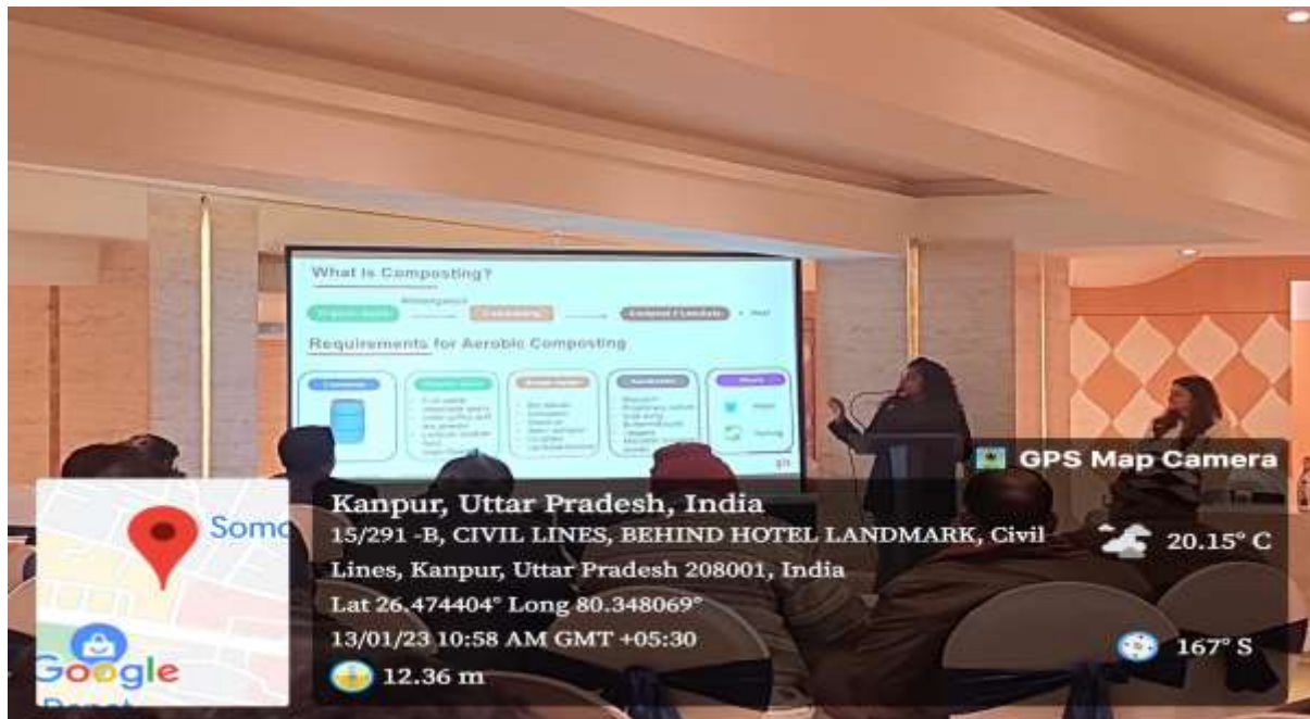
“Representative From GIZ explaining various steps involved in composting using charts and tables”