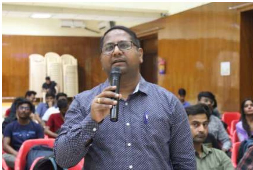
Active participation was also seen by our respected faculties.