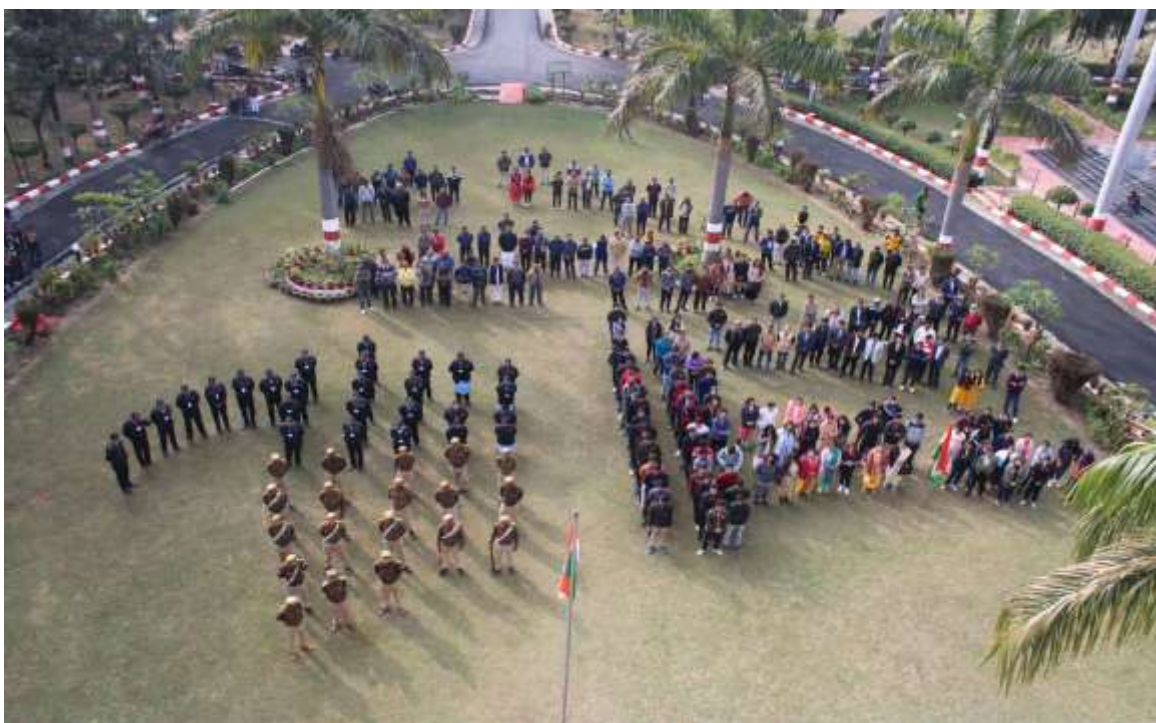
“All of the Attendees Pledging Together”