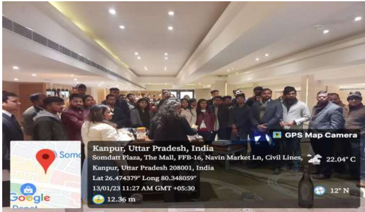
“One-on-One interaction between students and GIZ representative”