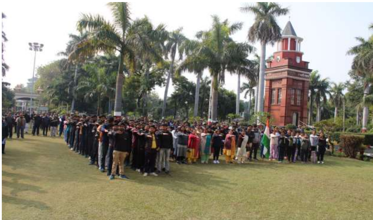
“College Students along with Other Staff Members”