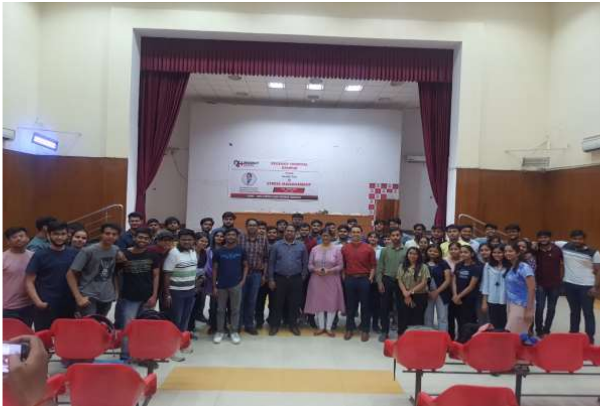
This was a whole team-work