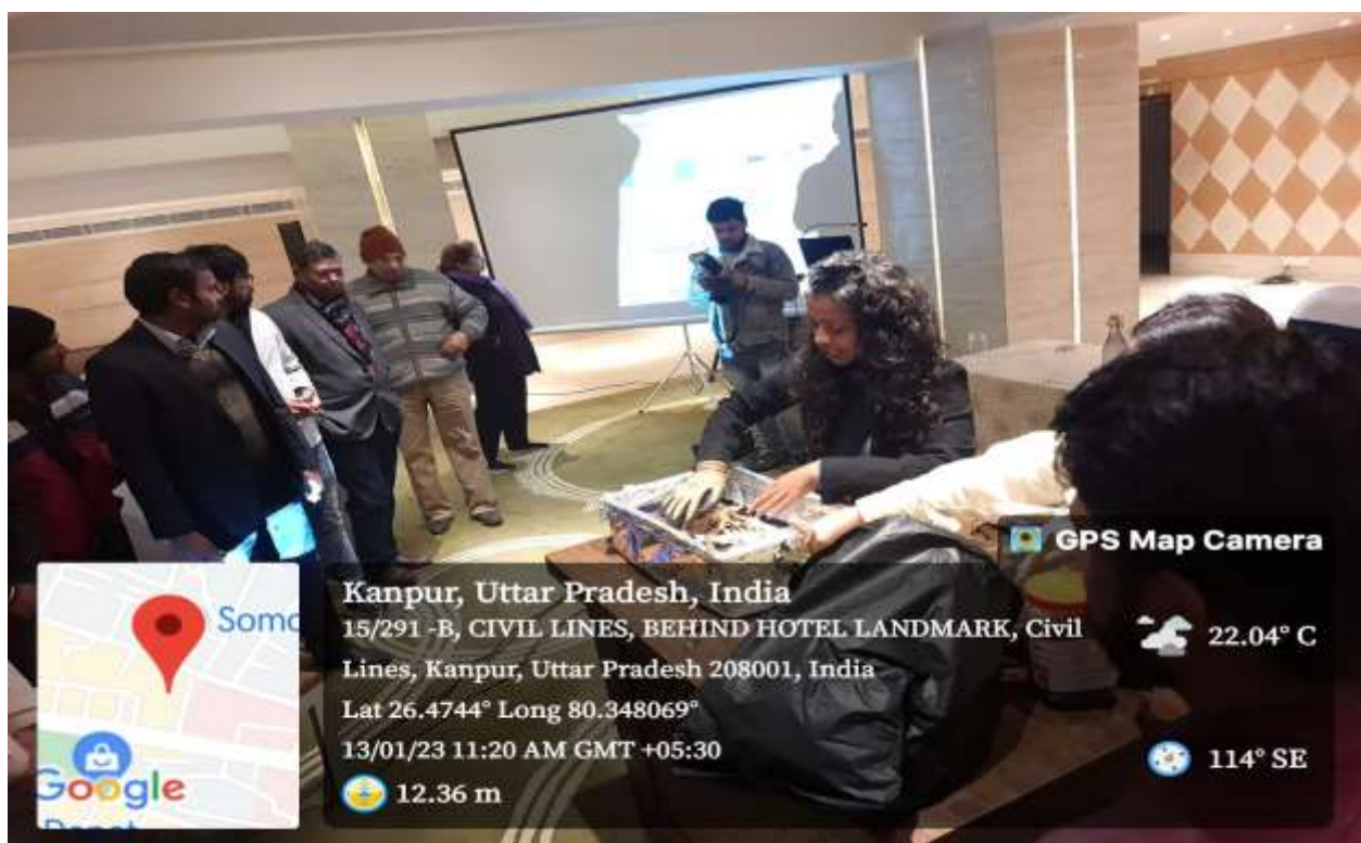
“Briefing on practical implementation of Composting”