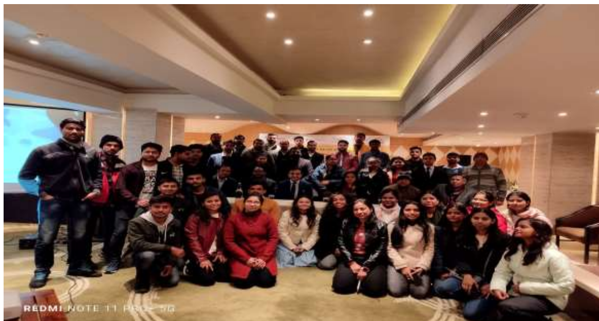
“All Attendees at conclusion of the event”